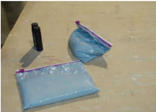
FUSION™ System resin and catalyst

The proper application of FUSION™ requires three specific steps. First, fill the joints completely, applying enough pressure to bring the FUSION™ level or flush with the tile surface. Second, after approximately 10 minutes, make a second pass to leave at least a 1/8 inch bead over the top of each tile joint. As the FUSION™ starts to “set or harden to a boiled egg consistency,” remove the excess from the surface of the tile (before it hardens) using a razor scraper. After each joint has been skived, check all seams for any low spots and reapply FUSION™ when necessary, using the same application and removal process. All tile seams should be on the same plane as the tile surface.