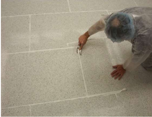
Remove excess FUSION™