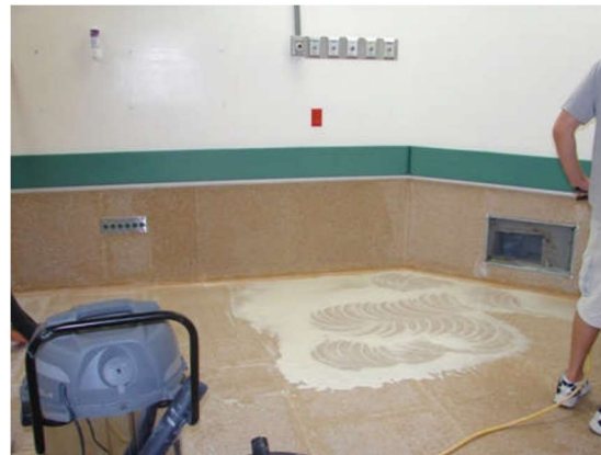
Wet-polishing procedure to remove any residue and eliminate lippage.