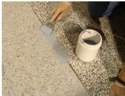
Apply FUSION™ to joints