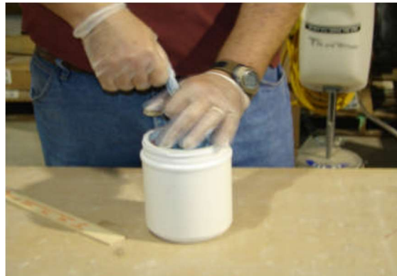
Mix resin and catalyst